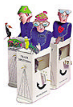
Moving Heads £2-20 (M) (makes 1 of 3 designs)