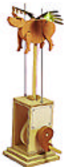
The Flying Pig