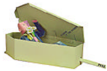
Pushing up the Daisies £2-10 (M)