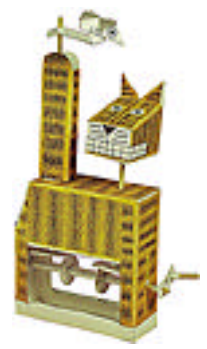
Cat Watching Bird £1.30 (M)