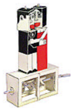
Kissing Couple £1-50 (M)