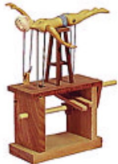
How to Swim