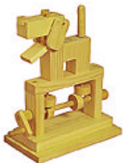
Yapping Dog £13.50