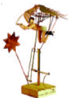
Icarus Flies Undone