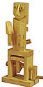
Hand Clapper £14.50