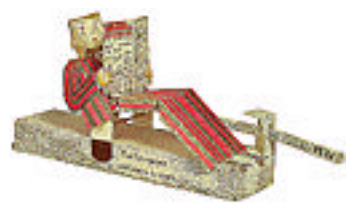
Newspaper Man £2-10 (M)