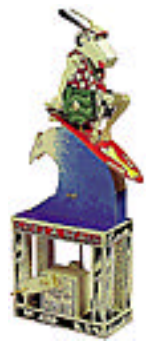
Surfing Dog £2-30 (M)