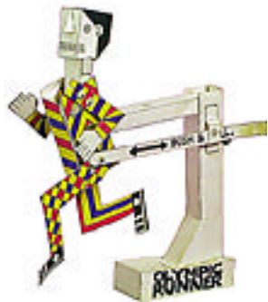
Olympic Runner £1-50 M