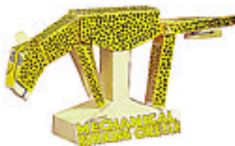
Cheetah £1-25 E