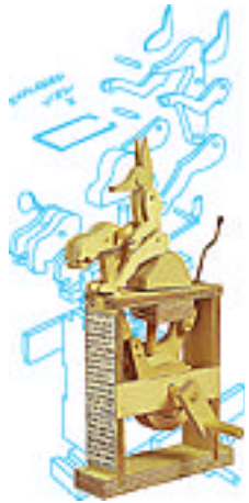
Camel Simulator £23-50