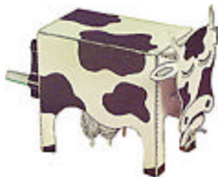
Chewing Cow £1-20 E