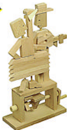
Flamenco Dancers £15-50