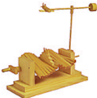
Wave Machine £13.50