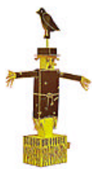
Scarecrow £1-20 (M)