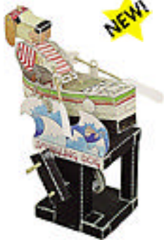
Smuggling Dog £2-30 M