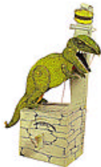
Hungry T-rex £1-25 M