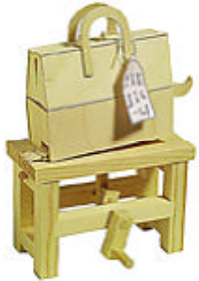
Cat in a Bag £16-95