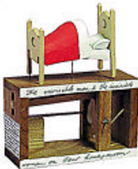
The Honeymoon Bed