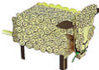
Chewing Sheep £1-20 E