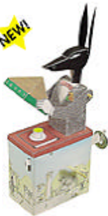
Anubis £2-50 M