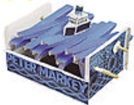
Wave Machine £1-50 M