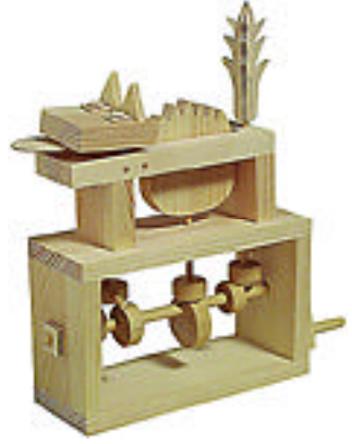
Angry Cat £15-50

Most people find these easier to make than the card kits because the parts are already cut out. You can also have fun with your own colour schemes.