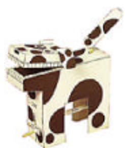
Dog £1-30 (E)