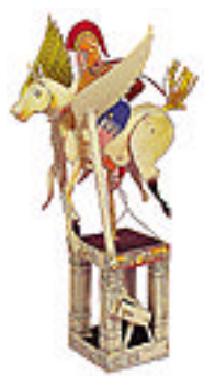
Pegasus £2-30 (H)