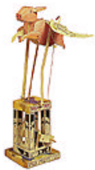
Flying Pig £2-30 (M)