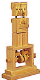
Kissing Couple £15.50