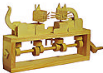
Copy Cats £15.50