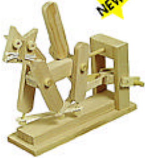
Walking Cat £14-50