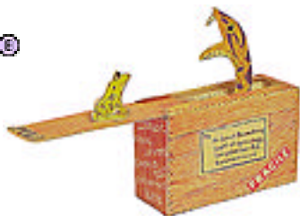
Snake in a Box £1-20 E

Printed card sheets to cut-out and assemble yourself. Hours of suffering and cut fingers. A good way to learn mechanical principles and impress your friends.