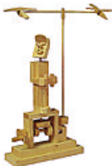
Bird Watcher £14.50